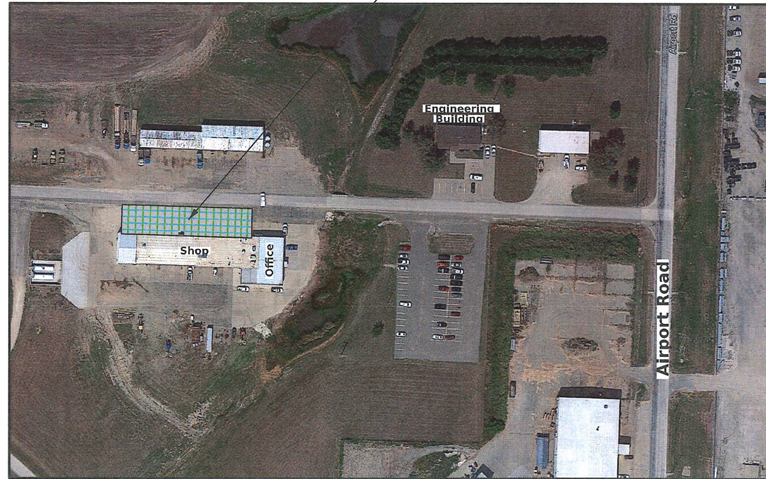
Saline County Road and Bridge Department 3424 Airport Road Salina, KS 67401

8" CONCRETE PAVEMENT NORTH SIDE OF ROAD AND BRIDGE SHOP